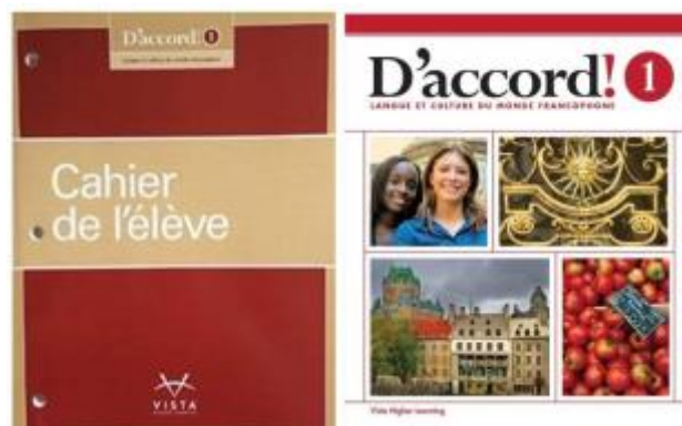
1 - Workbook