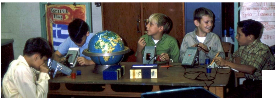
Viewlex Previewer Jr. filmstrip viewer, 1972 Fulton County Schools Archives

The technological revolution, which has changed the world so dramatically over the last century and a half, has also changed the classroom, impacting the ways in which teachers teach and students learn. Imagine a world without cell phones or computers. You might think it a difficult place in which to live since we have all these devices at our fingertips today. But whether students were taught using an abacus or an “app,” the goal has always been to prepare them for the world in which they will work and live.