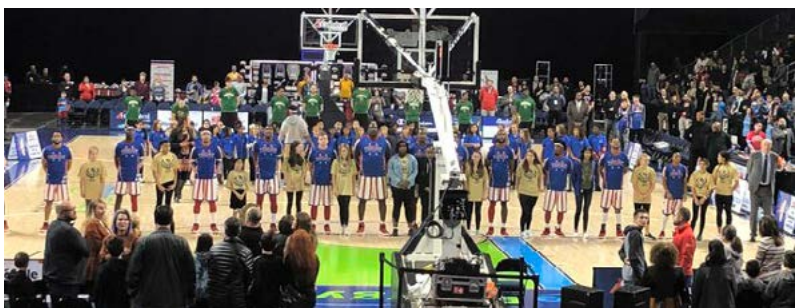
Dolvin Elementary Chorus sings at the Harlem Globetrotters game