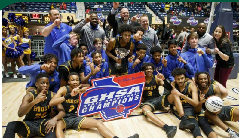
Chattahoochee 2020 Boys Basketball GHSA Region 7 6A