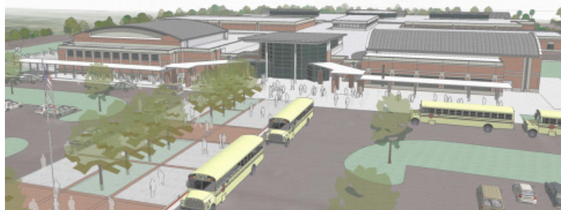
Crabapple Middle School Replacement Concept Drawing