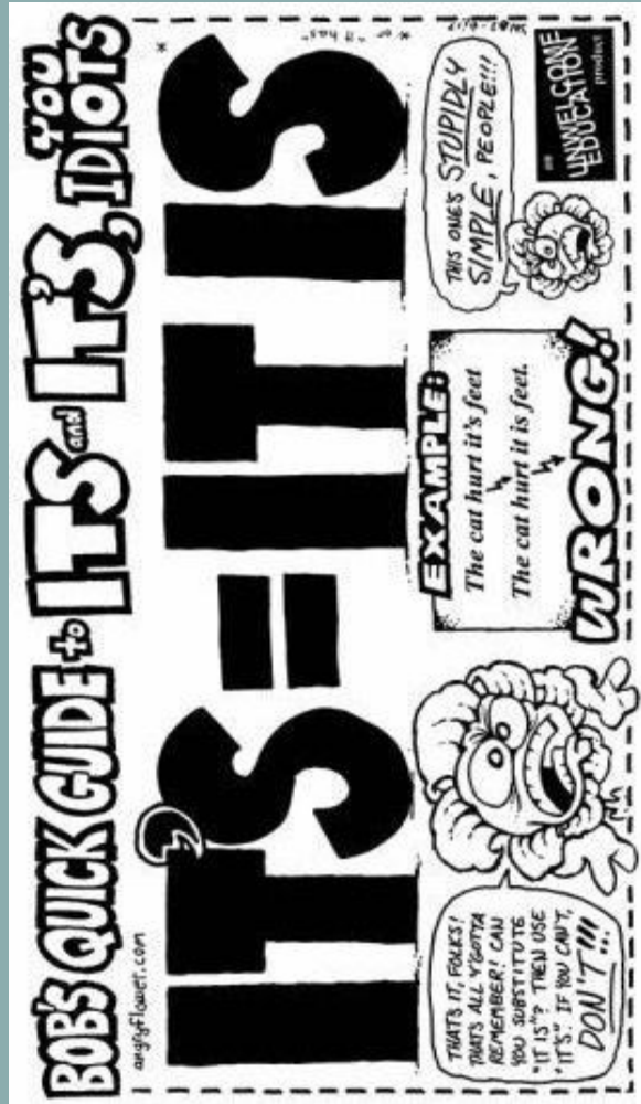
An Example of Classic Prescriptive Grammar