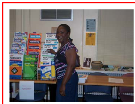
Resources available for parents' use