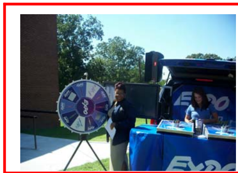
Parent Resource Center Open House

Workshops will be implemented again next year, so look for more information in the next edition of Title Talk.