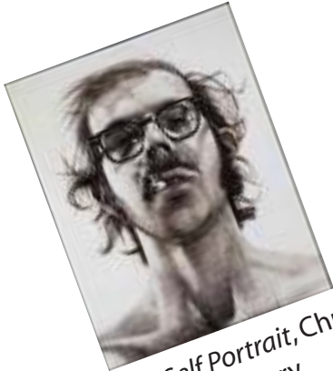
Big Self Portrait, Chuck Close Contemporary