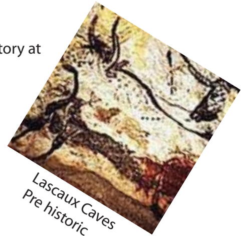
Lascaux Caves Pre historic